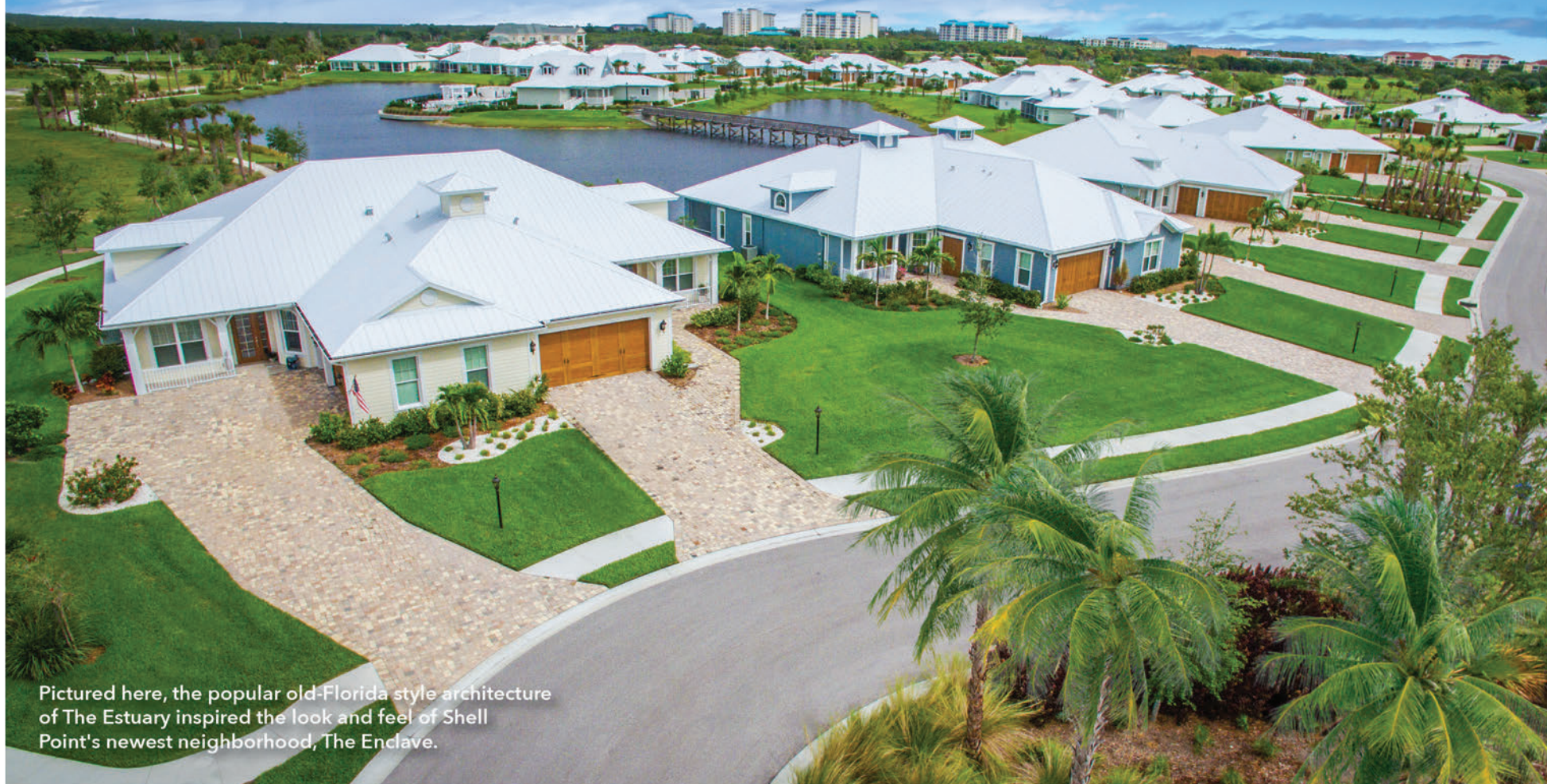
Pictured here, the popular old-Florida style architecture of The Estuary inspired the look and feel of Shell Point's newest neighborhood, The Enclave.

Due to the popularity of the original Estuary neighborhood, which was completed last year, Shell Point Retirement Community is pleased to announce plans for The Enclave.